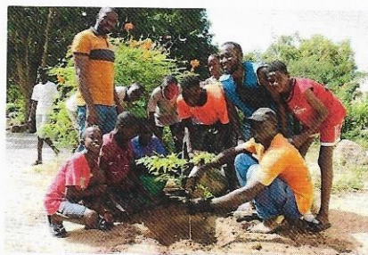
Children planting trees in the village

I am very happy, once again, to send you this letter to share news of the SOS Children's Village Kaolack. I hope this finds you and your family in good health. Here in Senegal, everything is going well and we are progressively returning to our daily routine. The children have returned from their summer vacation, and the village has come back to life. In this letter, I will share with you some of the highlights of our summer at the village. I hope you will enjoy these little anecdotes.